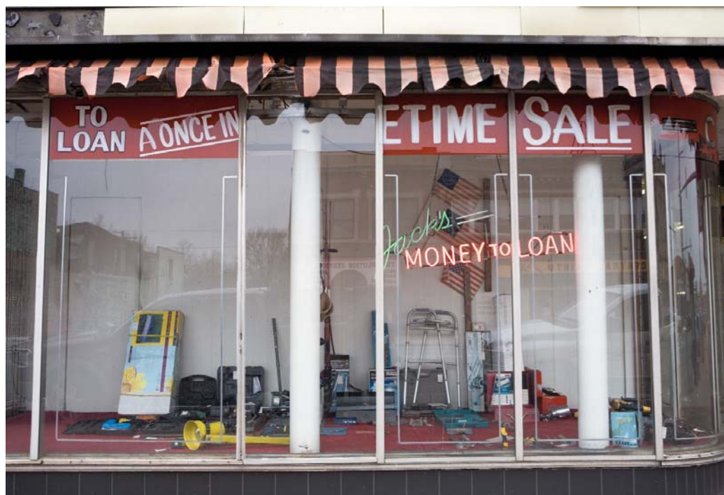
At left: Jack's Pawn Shop on Broadway (Gary, IN), 2007.

I N MID-TWENTIETH CENTURY AMERICA, a strapped wage earner who needed extra cash to pay an overdue utility bill, repair the family car, or make the rent had limited ways to get the necessary funds. Family and friends were often the first source of a short-term, possibly interest-free, loan. Failing that, pawn shops would take a wedding ring, musical instrument, fur coat, or some other piece of personal property as security for a small, high-interest loan. As a last resort, the local loan shark could provide the cash at predatory interest rates.